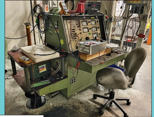
Misc. Pumps, Winding Machines, and Test Equipment

FOR COMPLETE LOT LISTING WITH FULL DESCRIPTIONS VISIT WWW.CIA-AUCTION.COM