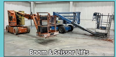
Boom & Scissor Lifts