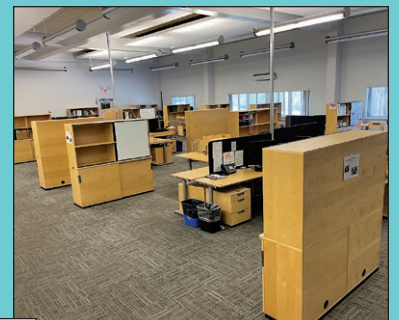
Pallet Rack, Large Qty. Plant Support, Global HQ Office