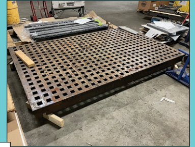
Fabrication Machinery – Punches, Shears, Turrets, Welding & Accessories