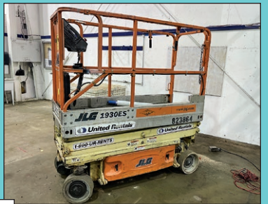
Pickup Trucks by Ford and Dodge, (5) Electric Lifts by Genie and JLG