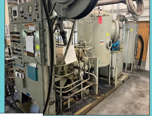
HD Pressure Chambers and Oil Processors & Purifiers