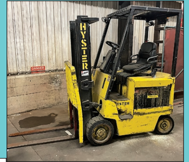
(5) LP Gas & Electric Lift Trucks by Clark & Hyster up to 8,000 lb.