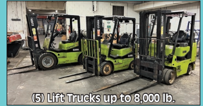
(5) Lift Trucks up to 8,000 lb.