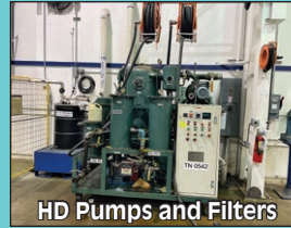
HD Pumps and Filters