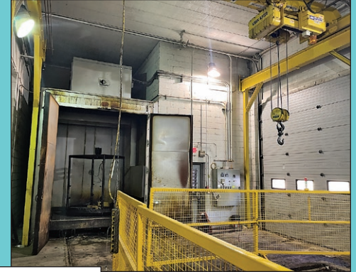
Gas and Electric Ovens by New England Oven, Grieve, Rockwell & TPS