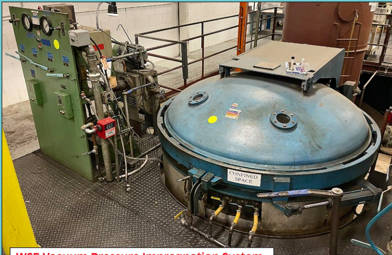
WSF Vacuum Pressure Impregnation System

INSPECTION: Tuesday, April 11th from 10:00 AM to 4:00 PM or by appointment with ryan@cia-auction.com