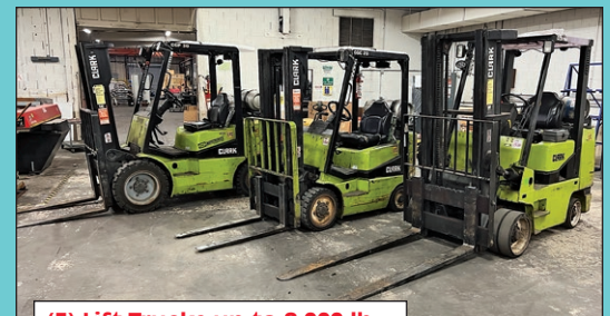
(5) Lift Trucks up to 8,000 lb.