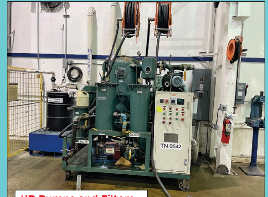
HD Pumps and Filters